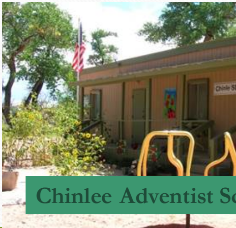
Chinlee Adventist Schol