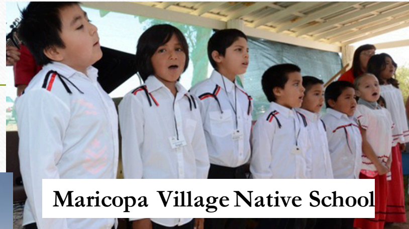
Maricopa Village Native School