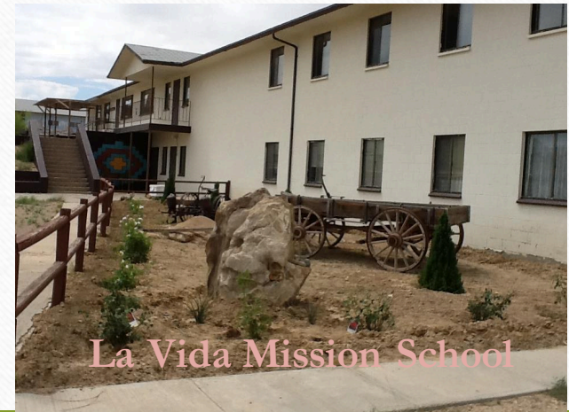
La Vida Mission School