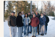
A closer look